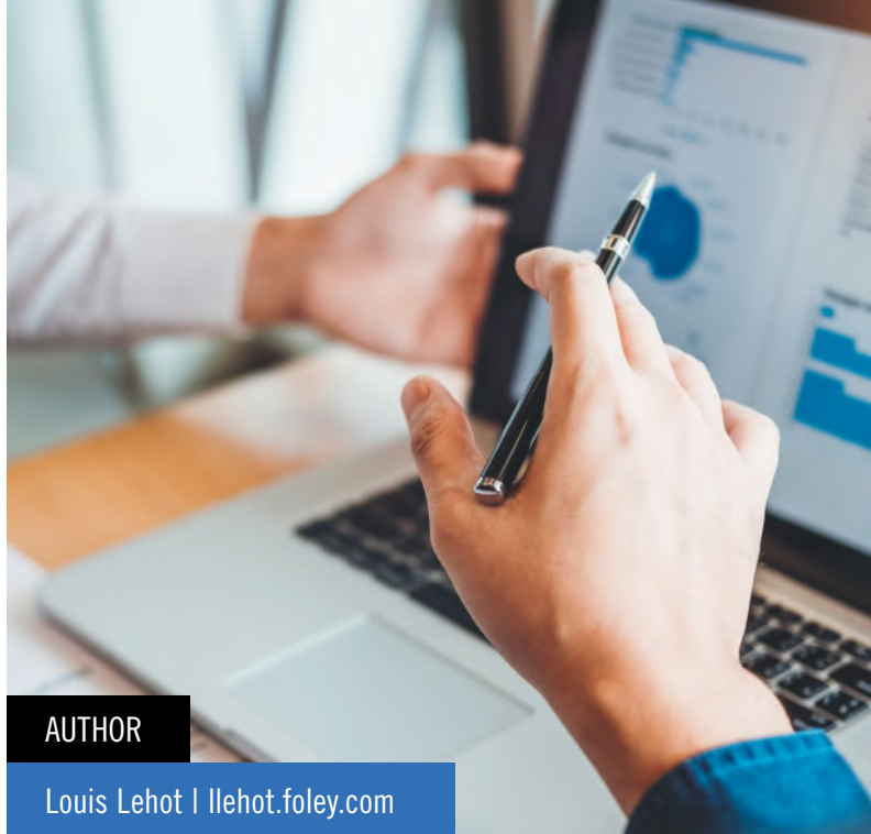
The market for SPACs vs. traditional IPOs in the last decade